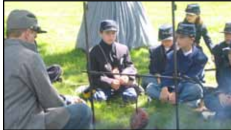
Annual Civil War Reenactment

Partnering with our community to develop students who are high-achieving lifelong learners and contributing world citizens.