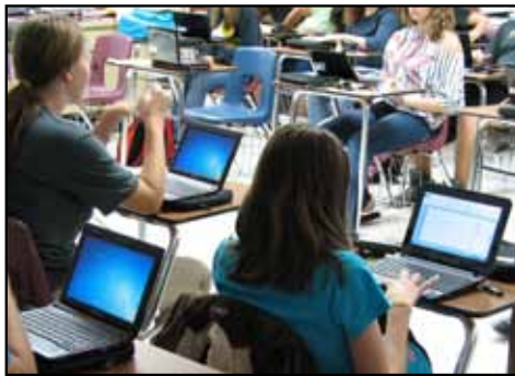
1-to-1 Netbook Initiative