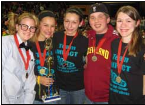
Destination Imagination Winners