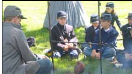
Annual Civil War Reenactment

Partnering with our community to develop students who are high-achieving lifelong learners and contributing world citizens.